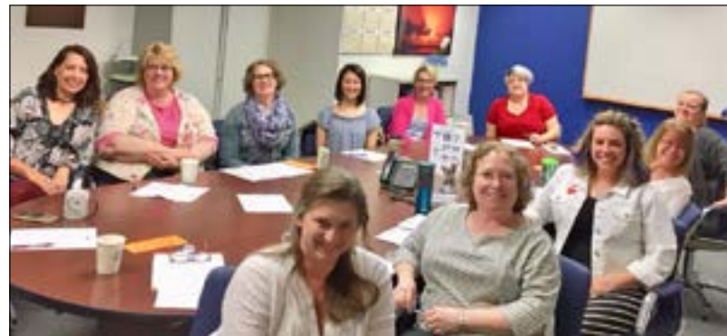
The Powerhouse Members of the Working with Women Committee