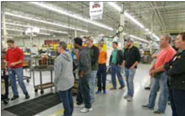
A Behind the Scenes Tour for the Public at Mate Precision Tooling