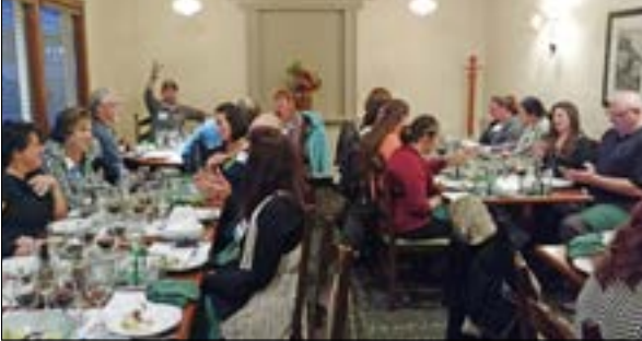
High-Quality Food, Wine & Connections at the Olive Garden After-Hours