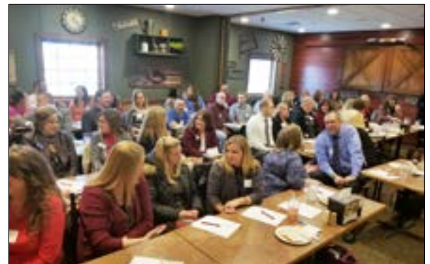
Lots of Connections at the Art & Science of Connecting