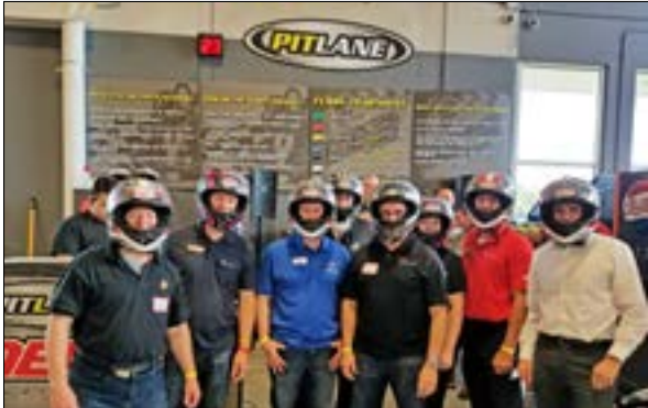
Feeling the Need, the Need for Speed, at MB2 Raceway