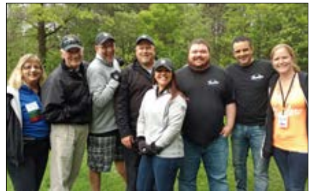
Just Another Hard Day at the Office, I Swear