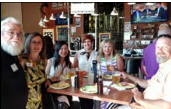
Business Was Brewin' at Bent Brewstillery