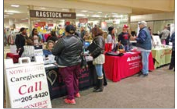
Bringing Job Seekers & North Metro Businesses Together